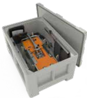
TRANSPORT BOX Optional