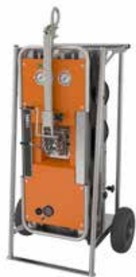
TRANSPORT CARRIAGE Optional